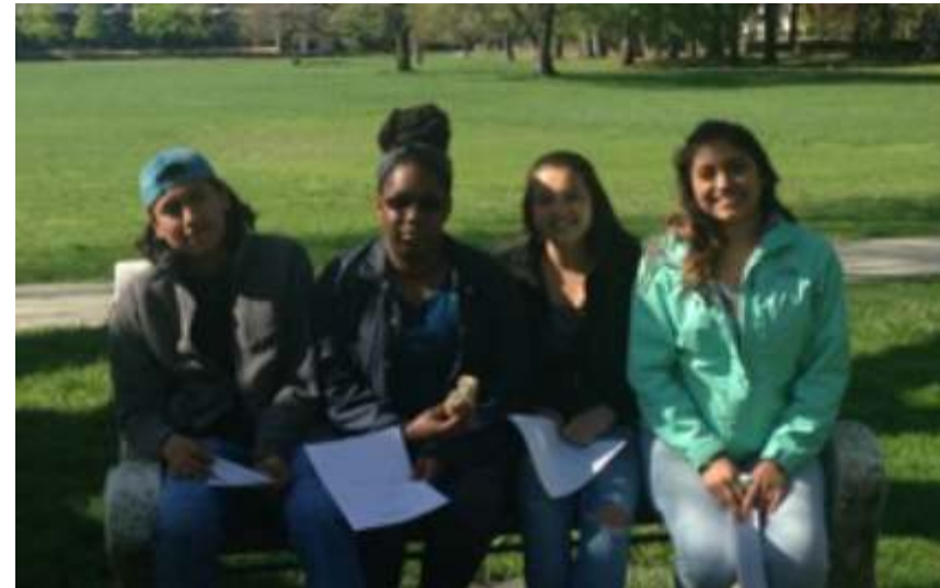
EPIC members sit outside of a dorm at Vassar.

EPIC is many things—youth activism, rural advocacy, empowerment, raising awareness—and it is a college readiness program. Our young people advocate for themselves as a crucial first step in creating a better world.